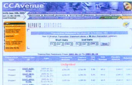
View details of all transactions over the past months

You can always upgrade to the premium scheme later, by paying the difference in the setup fees