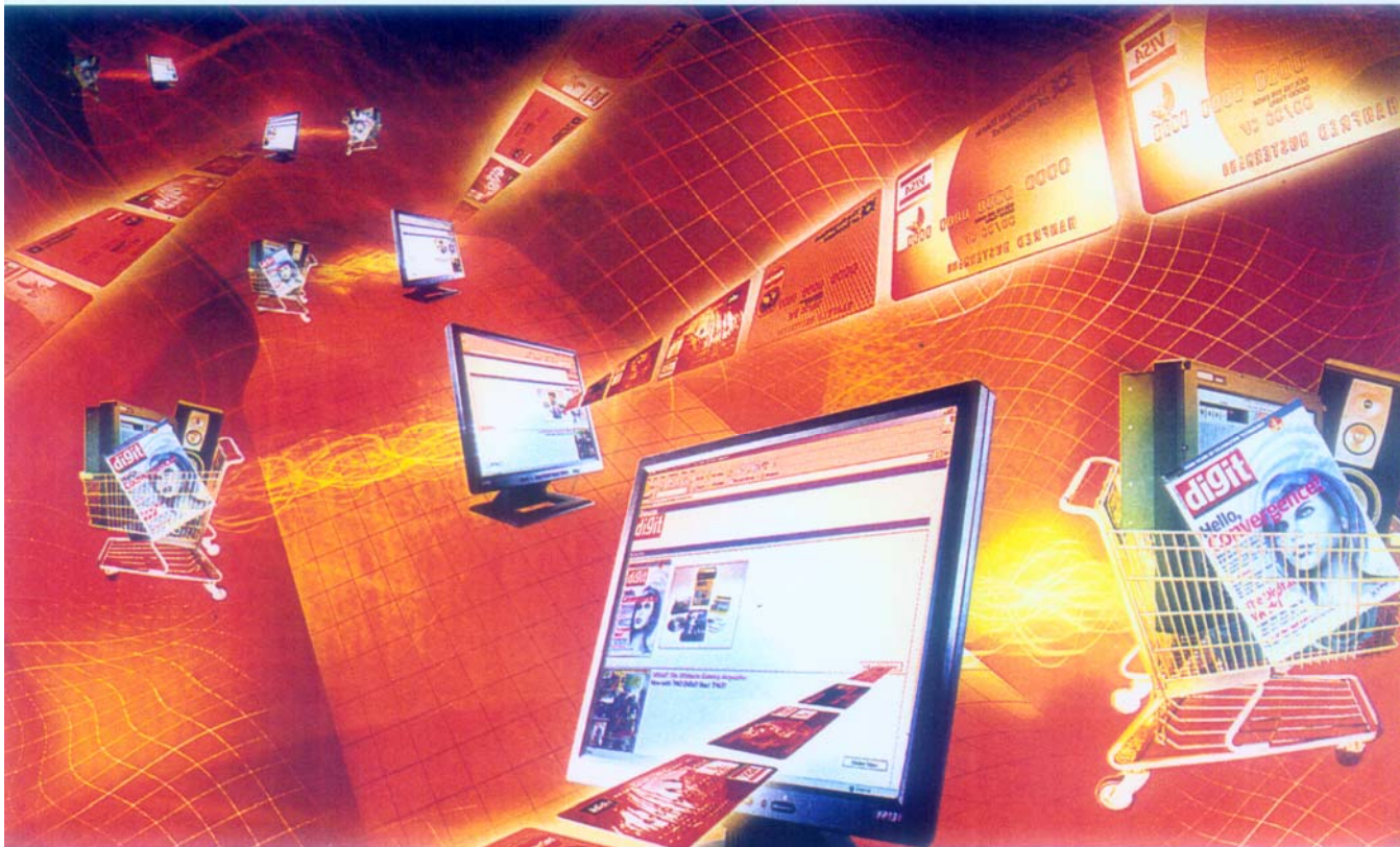
Imaging Binesh Sreedharan