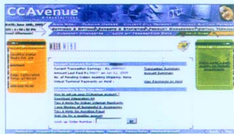
The main CCAvenue control panel screen

The Premium Scheme: This involves a one-time setup charge of Rs 25,000, and a software maintenance cost of Rs 2,400 per annum. They levy a charge of five per cent per transaction under this scheme, so for every Rs 1,000 that you sell online, Rs 50 goes to CCAvenue. You will have to price your products accordingly and cover this deficit of five per cent.