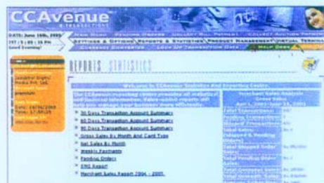
From the CCAvenue control panel you can get quick statistics for the past week, month, or year as well

viewable at http://snipurl.com/digit_cca2 . You will need to print this on a Rs 100 stamp paper, and have it filled in, signed and stamped by an authorised signatory for your company, and then snail-mailed to CCAvenue.